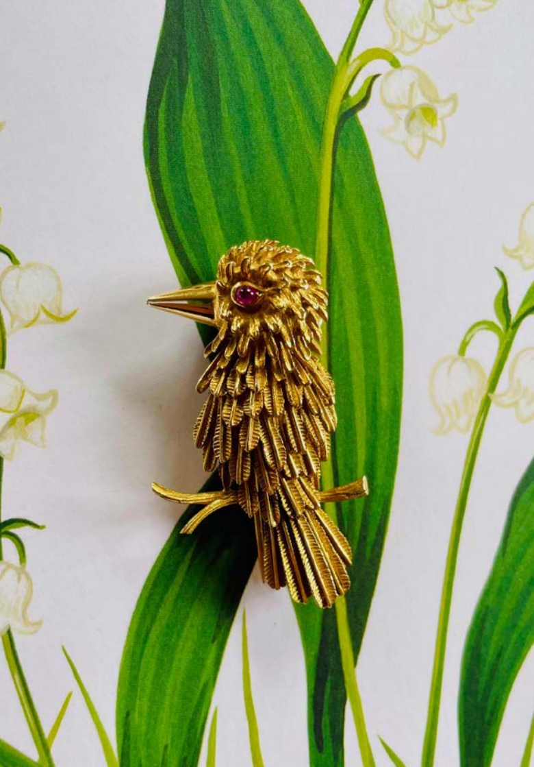
An 18K gold bird brooch sitting on a branch with a ruby eye. France, circa 1970. € 9.800